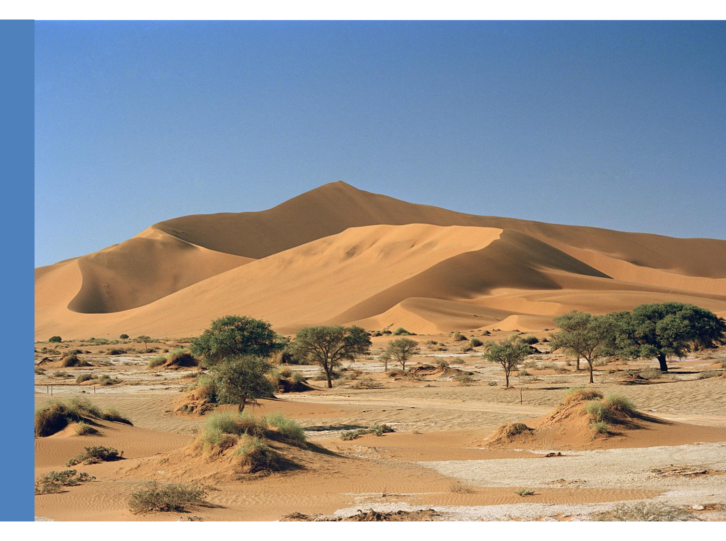
IFRC-UNDP Series on Legal Frameworks to support Disaster Risk Reduction