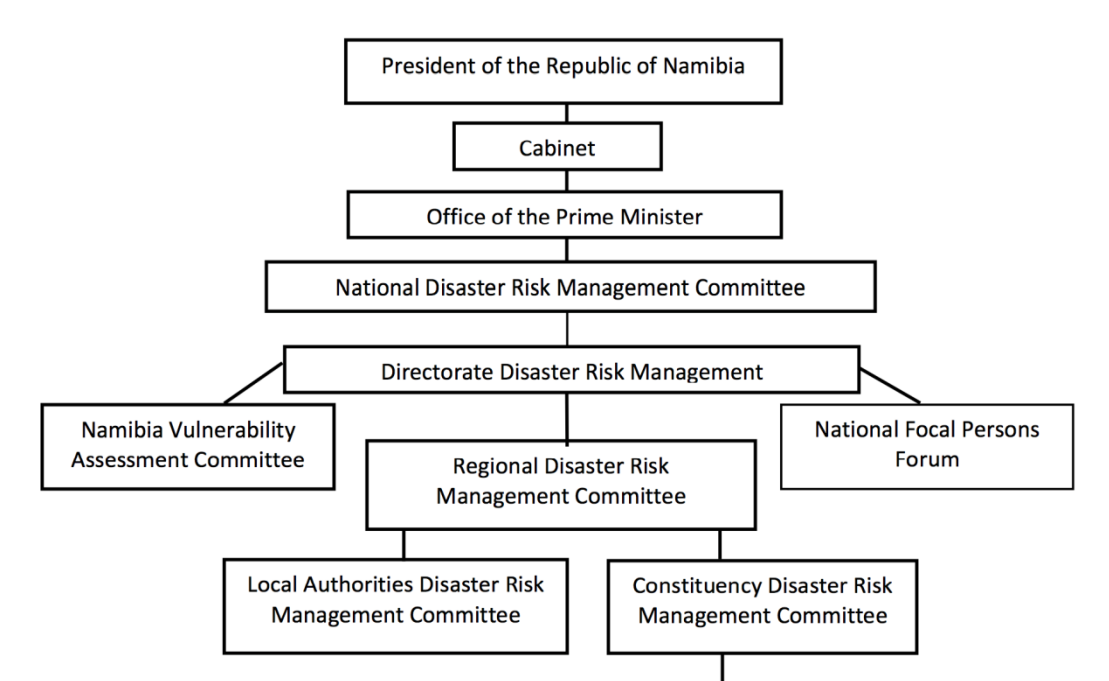
Figure 2: Institutional framework for DRM in Namibia ^{62}

Figure 2 above sets out the current institutional structure and reporting lines for DRM in Namibia. Perhaps the most strategically important of these institutions is the DDRM, which is responsible for coordinating DRM activities and executing the decisions of the National DRMC. The current organizational structure of the DDRM is set out in Figure 3 below.